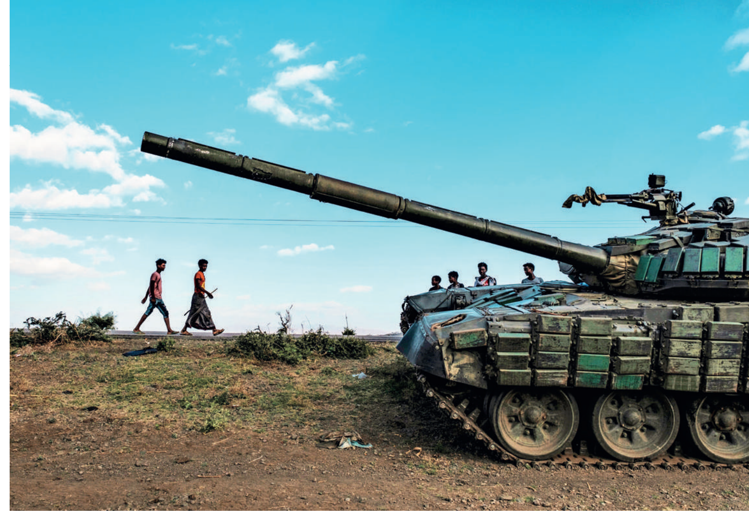
People walk next to an abandoned tank belonging to Tigrayan forces in Mehon on December 11, 2020

could have had a better political strategy. Instead of antagonizing all of TPLF's inner circle, he could have been more strategic in handling those who were initially inclined to support his reform agenda. This also reflects the difficulty of managing political change in states like Ethiopia which are in political transition. Unless there is slow and careful management of the political forces in a country, it always creates further complications and it can endanger democratic political changes in states with the fragile political climate. Because of this, TPLF used incessant propaganda to demonstrate that ethnic Tigrayans have been singled out and targeted by Prime Minister Abiy's administration. This helped them regain their political legitimacy in Tigray, which was initially significantly compromised.