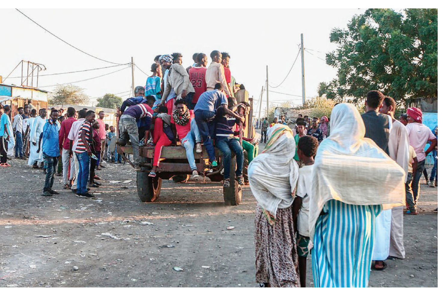
Ethiopians who fled fighting in Tigray, Ethiopia, gathered in a bordering Sudanese village in November 2020 as refugees flowed into the area

The TPLF, rather expectedly, opposed the dismantling of the EPRDF and has boycotted the Prosperity Party, which drove it towards increasing confrontation with the Abiy administration. The TPLF reportedly sought to build a pro-federalist alliance among ethnonationalist forces against the federal authorities (Borkena, 2019) in an apparent attempt to fight back what its leadership seems to consider an orchestrated centralization of power favoring the Amhara at expense of Tigray. Following the government's announcement that it would postpone the August 2020 general election until 2021 due to the COVID-19 pandemic, which automatically meant an extension of the appointed Prime Minister's tenure, the TPLF, along with some other opposition forces, ceased to recognize the federal administration as legitimate. Then, on September 9, 2020, despite the postponement of the general election, the TPLF went ahead with a regional election in Tigray and tightened its grip of the regional administration further by expected repeating of its 2015 electoral success. At the federal level, the Tigray regional election was ruled unconstitutional and the Prime Minister consequently characterized it as illegal (Paravicini, 2020).