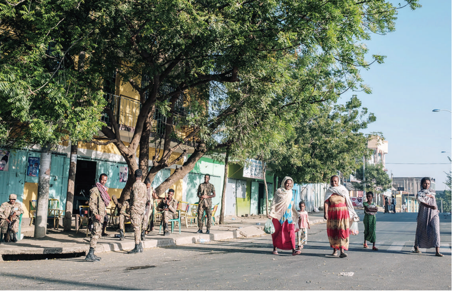
A group of women and children walk next to members of the Amhara Special Forces in Humera street in the Tigray region, Ethiopia