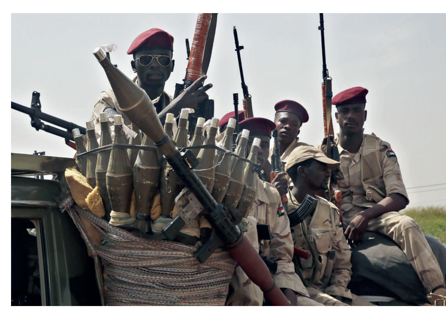
Sudanese militia, the Janjaweed, pictured in Sudan in 2019

The vision of a future conducive to the protection of human rights standards as expressed in the Universal