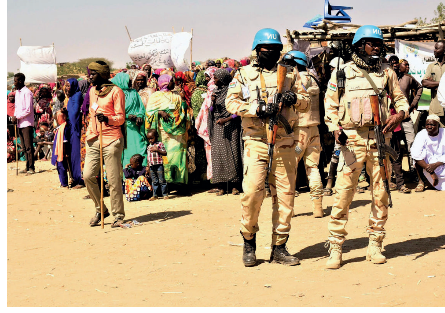
United Nations and African Union peacekeeping mission at a protest against the mission's withdrawal in South Darfur in late 2020.

such example of the political machinations underlying such recognition, and reflecting the prioritization of strategic geopolitical interests over affirming the right to restitution, recompense, and rebuilding that constitute the entitlements of survivors. Indigenous and ethnic minority populations have historically faced the brunt of such oppressive regimes and state-sanctioned violence, discriminatory practices, and a systematic denial of their fundamental and human rights, and the present lack of recognition on a global scale does not bode well for the future.