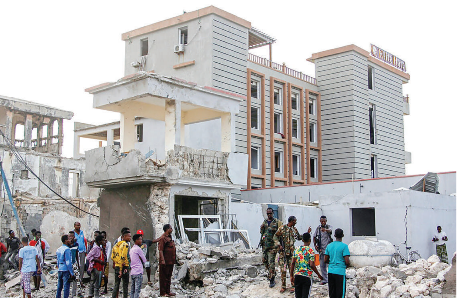
Security forces inspecting the wreckage at the scene of a militant attack outside the Elite Hotel in Mogadishu, Somalia in August 2020

Cases have been widespread in Somalia affecting many, despite the official low numbers. The low numbers are