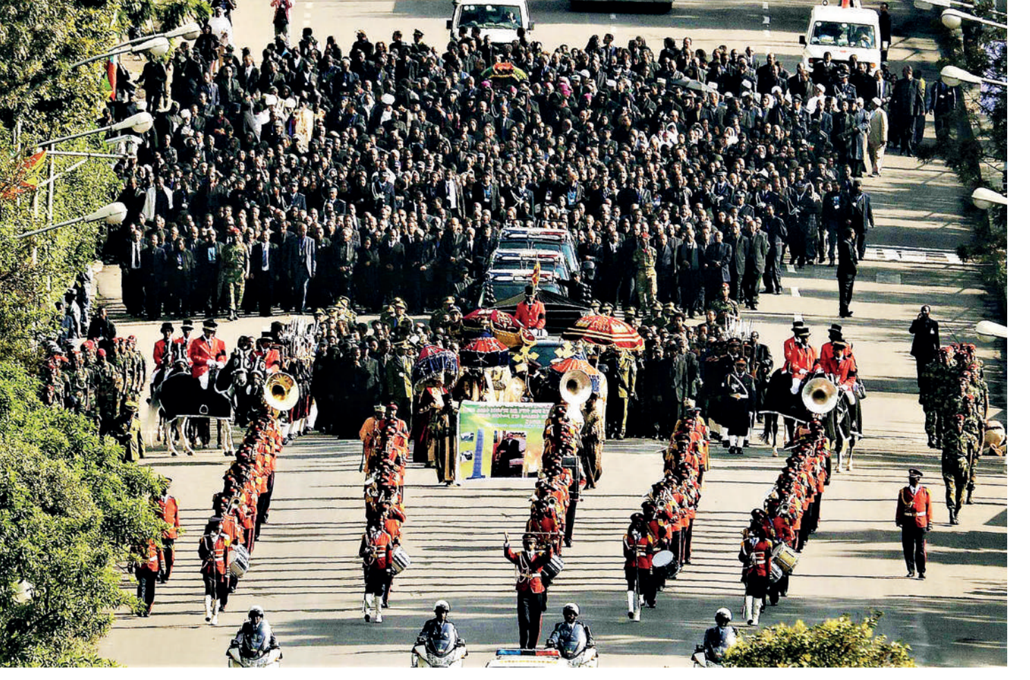
A funeral procession during Ethiopian Prime Minister Meles Zenawi in Addis Ababa on September 2, 2012

of the relentless struggle of Ethiopians (the majority of them young people) for better political and economic governance, and a demand for respect for human rights. TPLF that had dominated the ethnic federal arrangement that formed the fundamental ideological basis of the governing party, the EPRDF, lost its ideological relevance and efficacy, leading to its ultimate demise. There are a number of factors that explain the fall of TPLF and the capitulation of its fierce and unchallenged political control in Ethiopia for close to three decades.