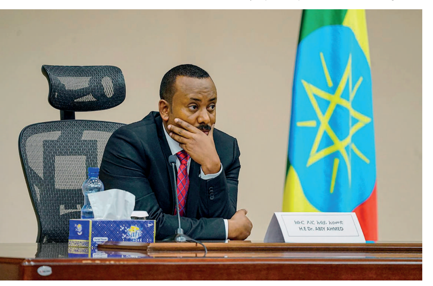
PM Abiy Ahmed looks on at the House of Peoples Representatives in Addis Ababa, Ethiopia, on November 30, 2020

The third and most significant aspect of Prime Minister Abiy's political predicament is the rising ethnic