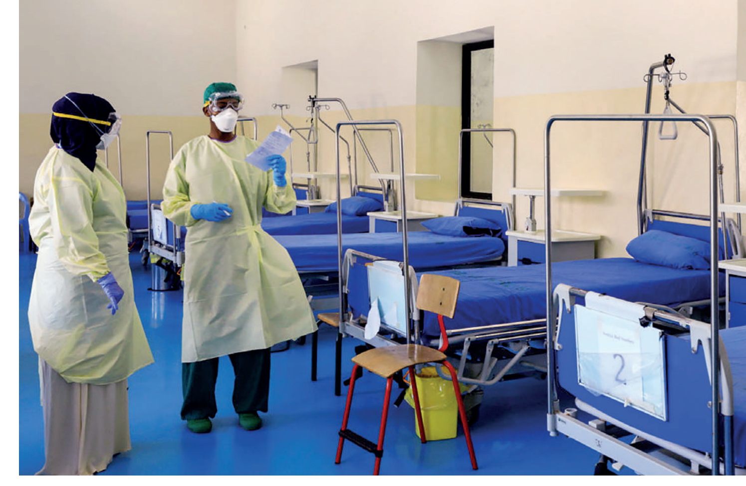
A Somali doctor and a nurse prepare a ward for COVID-19 patients at the Martini Hospital in Mogadishu, Somalia on March 18, 2020

to treat and handle outbreaks of diseases including pandemics.