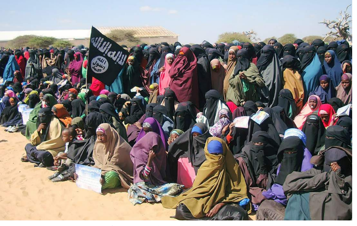
A photo showing a section of women in Somalia