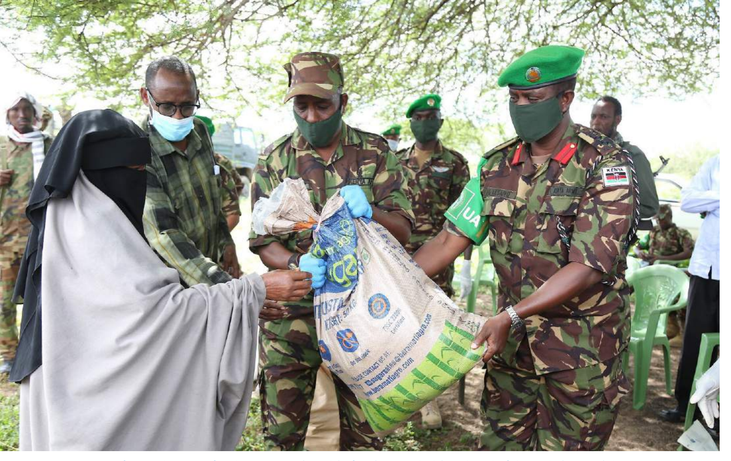
AMISOM forces donating food items to vulnerable families in Dhobley ahead of the Eid ul Fitr celebrations in May 2020