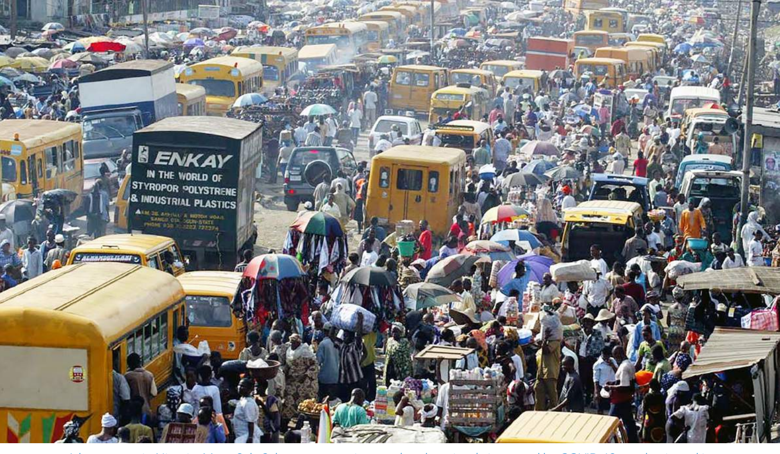
A busy street in Nigeria. Many Sub-Saharan economies are already seriously impacted by COVID-19 pandemic and it will take long to achieve pre-COVID-19 growth rate levels

people infected; a death toll of more than 200,000 people across the world as of April 20, 2020 (WHOa, 2020); increasing lockdowns, and a direct hit to the global economy. The COVID-19 pandemic is the defining global health crisis of our time and the greatest challenge we have faced since World War II. This is more so because COVID-19 is much more than a health crisis and affects every sector, with the potential to create devastating social, economic and political crises that will leave deep scars beyond the direct health implication of the virus (UNDP, 2020).