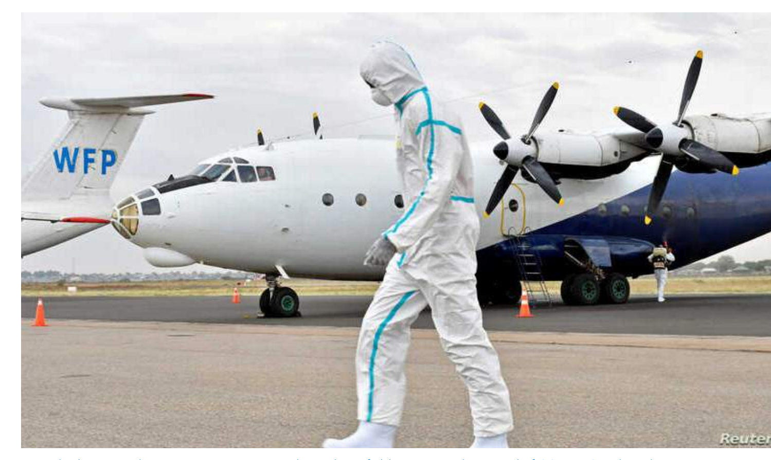
A medical personnel wearing a protective suit cleans the airfield to prevent the spread of COVID-19 at the Juba International Airport in Juba, South Sudan, on April 5, 2020

Fourth, wealth inequality and poverty impede healthcare provision. Globally, COVID-19 has exposed the urgency for poverty alleviation and the need to bridge the gap between the haves, have-nots and have-lots. It has