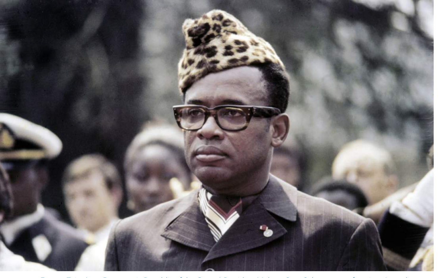
Former Zaire (now Democratic Republic of the Congo) President Mobutu Sese Seko at a past function. According to Transparency International, Mobutu embezzled over USD five billion from his country

the DRC (von Billerbeck & Tansey, 2019). Moreover, lack of government and regional cooperation has also undermined MONUSCO's peacekeeping efforts. The support given to rebel groups by neighboring countries has weakened the effectiveness of the mission's mandate (EPON, 2019). Sustainable and transformational change has been sacrificed at the altar of stability and continuity by the regional allies and this does not do justice to real change and conflict free environment in the DRC.