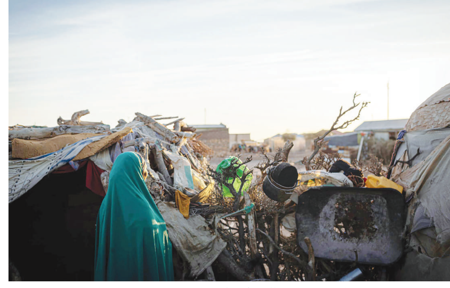
A young woman stands in her home at an IDP camp on the outskirts of Somaliland

officials and allied militia. Such individuals have been implicated in a significant number of rape and sexual harassment allegations against displaced women and girls. Many of these "gatekeepers" have strong ties to district commissioners and local officials and commit other abuses of power within the camps such as stealing food and restricting movement (HRW, 2013).