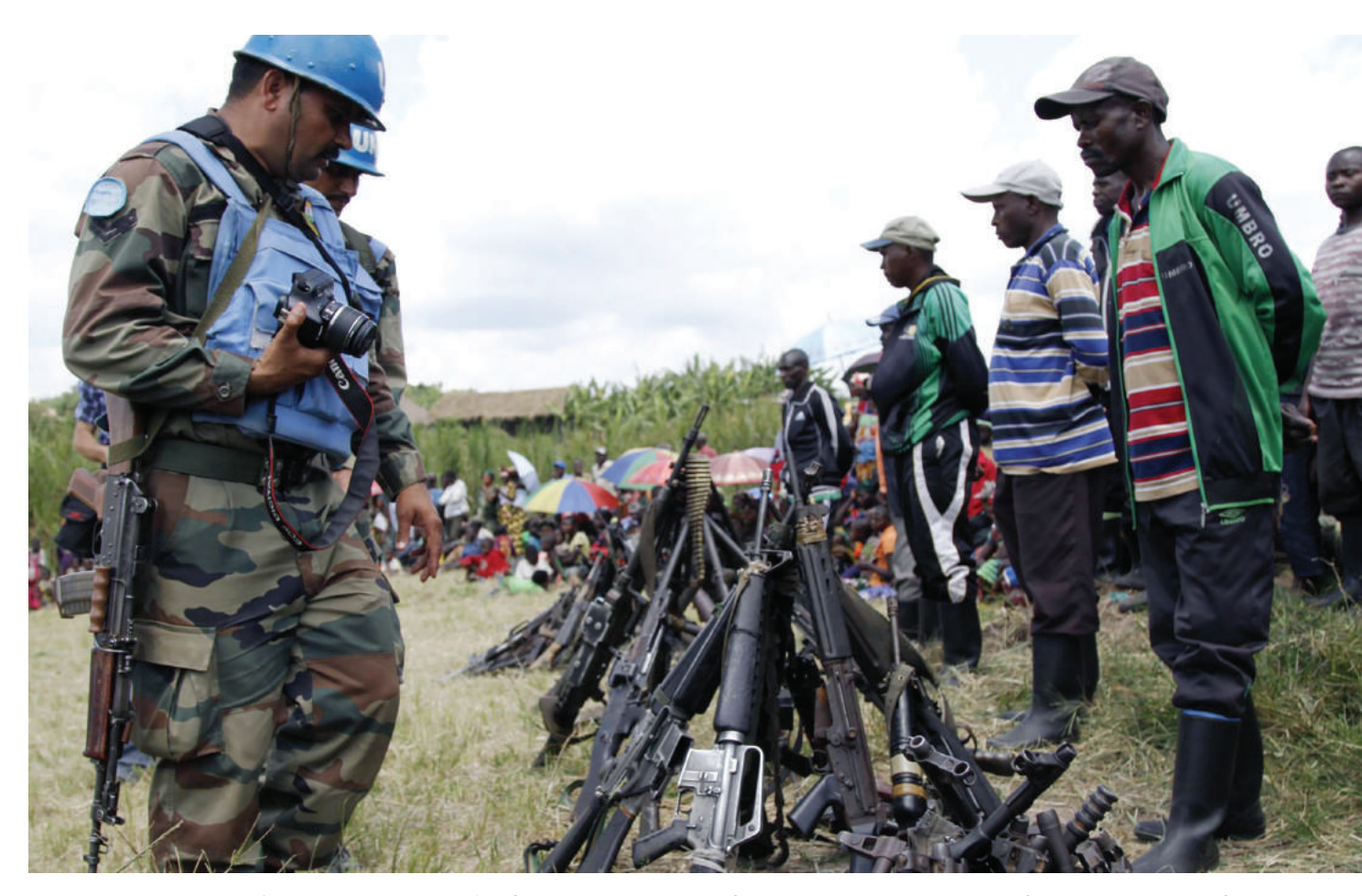
United Nations peace keepers record details of weapons recovered from the Democratic Forces for the Liberation of Rwanda (FDLR) militants after their surrender in DRC

respectively, entered into an agreement in 2008-2009 in a bid to restore diplomatic ties. The two launched a joint military mission in the eastern part of the DRC. However, the, ease of tensions did not last for long though as they escalated again with a Rwandan-backed rebellion known as M23. Bilateral and multilateral relations continue to deteriorate in the region, relations are murky between DRC and Uganda and between Rwanda and DRC (Ntung, 2019). The mistrust is caused by the belief that each of these countries supports military groups and this has caused regional instability. There has been however, progress in the Rwanda-DRC relations but persistent mistrust remains. The volatile regional relations among the Great Lakes countries makes it difficult to collectively deal with armed military groups. The existing mistrust among these nations makes the overall goal of achieving sustainable peace in the region, East of DRC in particular, a difficult mission.