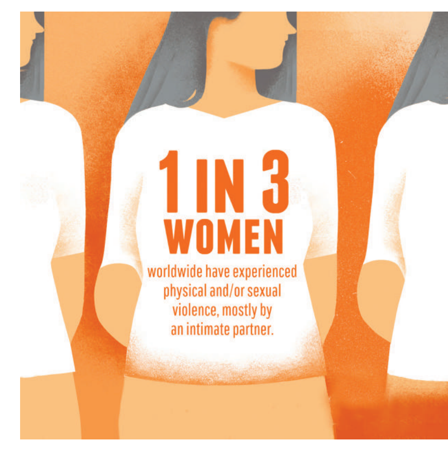
An infographic highlighting the prevalence of GBV

Gender-based violence (GBV) is often all encompassing and rooted in fundamentally discriminatory norms and practices (Camey, Sabater, Owren et al, 2020). It is referred to as a "global pandemic" that is economically and socially boundary-less. It is a direct result of gender inequality, often structurally entrenched and has adverse effects on individuals and communities psychologically, financially, socially and physically. In the context of environmental degradation and climate change, GBV exacerbates the impact of such changes. Various forces work in tandem to further entrench inequalities. The notion of economic violence for instance disproportionately impacts women and girls who largely make-up those living in poverty globally (Camey, Sabater, Owren et al, 2020). Gender imbalances in regard to access and control of natural resources such as water, agriculture and land are common instances of economic violence. GBV is often weaponized as a means of controlling access to these resources. In some contexts, sexual favours are exchanged for land rights (Camey, Sabater, Owren et al, 2020). Such imbalances are entrenched in legal systems as well as societal norms which dictate gender roles. Additionally, the very nature of gender roles increases women's vulnerability and exposure to assault or harassment (Camey,