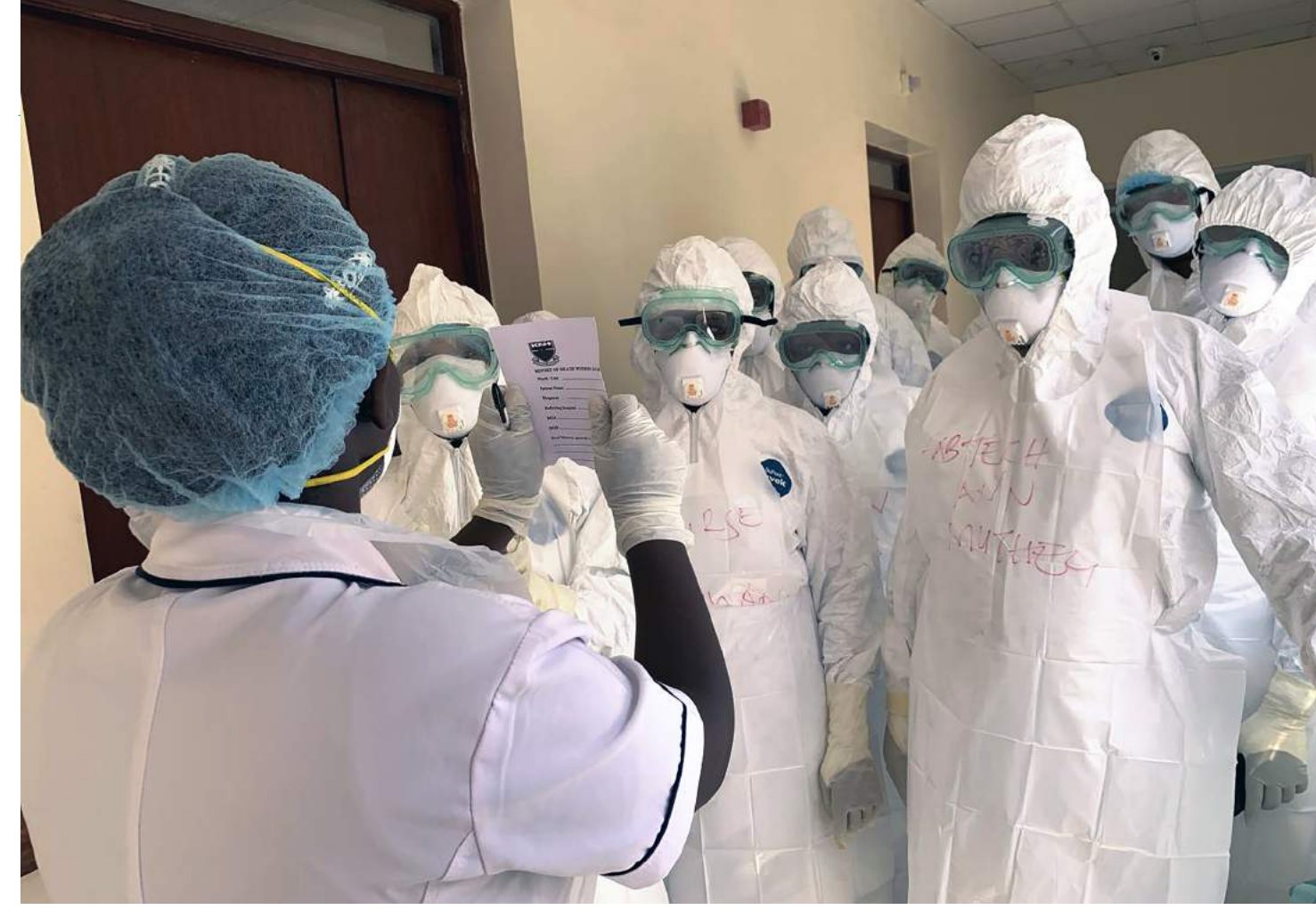
Doctors and nurses in Kenya preparing to attend to COVID-19 patients

and Prevention are mobilizing a special anti-COVID-19 response fund and international economic support. However, COVID-19, unlike Ebola, has presented a worldwide catastrophe, affecting donors who are now looking to strengthen their own systems and economies. Most African governments are thus not able to maintain social security, a social grants system, or unemployment benefits. There is a risk that the already vulnerable populations will sink deeper into poverty. As countries fight the COVID-19 pandemic, there will be a need, immediately after the lockdown or shortly after, to have a look at more sustainable ways to recover the economy.