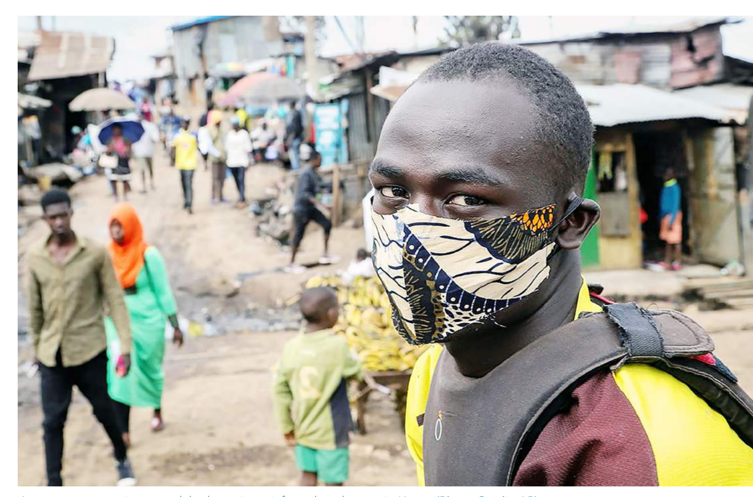
A young man wearing a mask looks on in an informal settlement in Kenya

During this pandemic, health systems must rapidly reorganize and expand service delivery to respond to COVID-19, while maintaining essential core services across the continuum of care. Some organizational changes recommended by WHO include: (i) to designate hospitals to receive COVID-19 patients and prepare to mobilize a possible surge in acute and ICU admissions; (ii) to maintain continuity of essential services while freeing up capacity for COVID-19 response; and (iii) to train, repurpose and mobilize the health workforce according to priority services; and review supply chains and