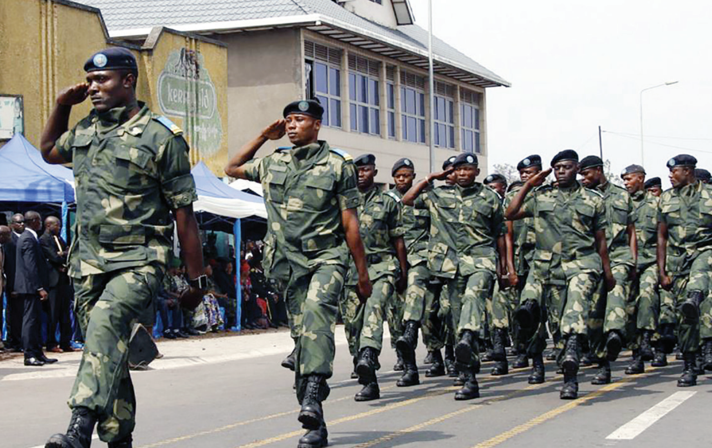
Members of the Democratic Republic of Congo (DRC) Forces at a past Independence Day parade.

for desertions have been rare, many groups have never been confronted with significant military pressure, and deserters have always been welcomed back into the fold, creating a revolving door of army integration and defection (Stearns, Verweijen & Erikson Baaz, 2013). In other words, army loyalty was not rewarded while mutiny and subsequently taking part in DDR programs was.