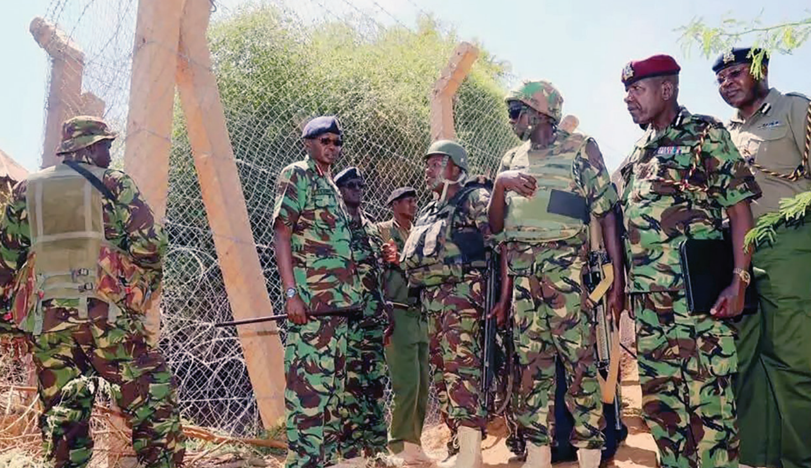
Former Inspector General of Police, Joseph Boinnet, inspects a section of the Kenya-Somalia border wall. The wall was constructed to bar unwanted persons from freely crossing over into the country.

extra measures to control borders and extra security measures in territories and areas where no official control takes place. In summary, bordering practices range from barring, curtailing, preventing, regularizing, facilitating to assisting movements of persons, living creatures, goods, information and communications across borders.