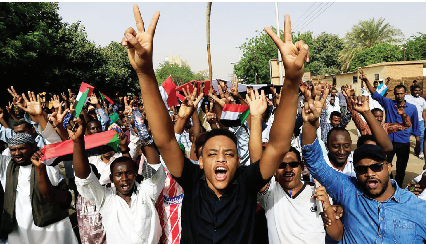
Sudan protesters celebrating the end of Omar al-Bashir's rule outside the defence ministry in Khartoum on April 11, 2019

On April 25, 2003, two rebel groups, the Sudan Liberation Army (SLA) and the Justice and Equality Movement (JEM), began a major offensive against the Government of Sudan by attacking and capturing a number of government installations, including El Fasher airport. The two groups had the backing of the Sudanese People's Liberation Army (SPLA), a major rebel group in the South of the country. The conflict was triggered by long-running resentment against marginalization of non-Arab tribes in the Darfur