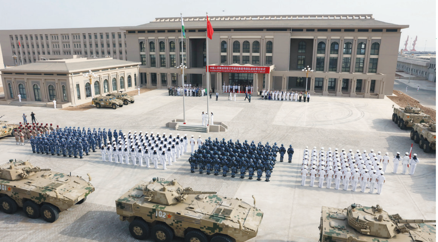
China's military base in Djibouti. The base has become an important outpost for China in the Horn of Africa.

the United States (US) adjustment of its foreign policy in response to this reality, militarization of the region with establishment of strategic military bases in Djibouti by global powers, and the vulnerability of the region to external pressures given the region's domestic socio-political and economic fragility.