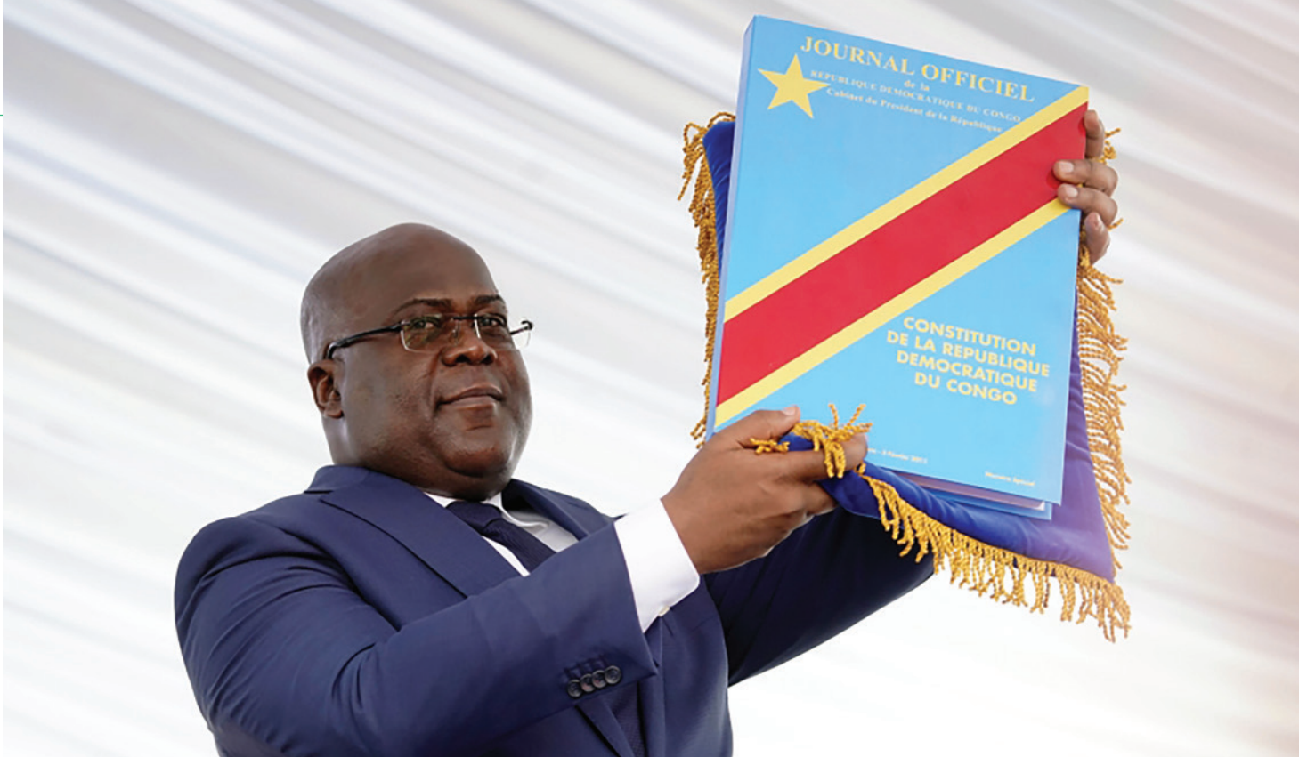
Felix Tshisekedi was elected president of the Democratic Republic of the Congo, succeeding Joseph Kabila in the vast central African country's first transfer of power through an election in 59 years of independence (Photo Credit: Al Jazeera/News Agencies).