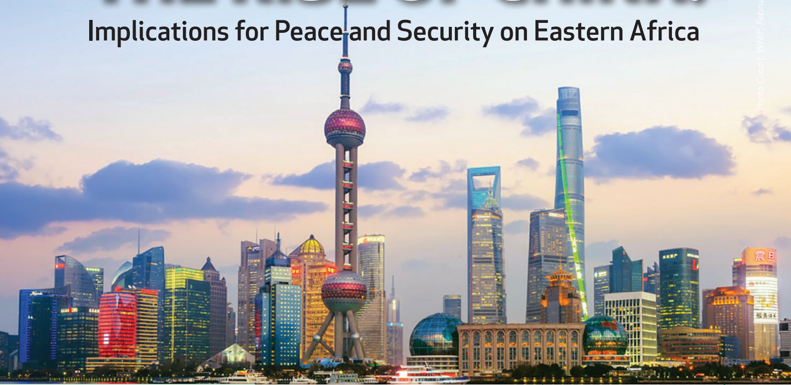
February 26, 2019

Implications for Peace and Security on Eastern Africa