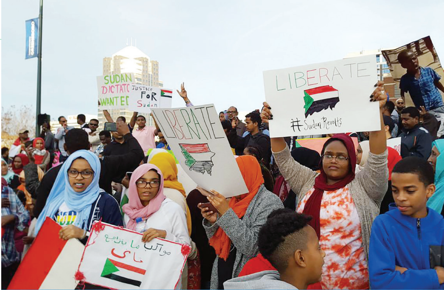
Sudanese gathered in the thousands to demonstrate in the Sudanese capital of Khartoum, calling for President Omar Bashir to step down.

depreciation of the Sudanese pound, occasioning a high cost of living and cash crunch in 2018, in the lead up to December protests. Even after the lifting of US sanctions, Sudan is still unable to access the International Monetary Fund or World Bank support, remains outside the World Trade Organization (WTO) and most western banks refuse to serve it (Werr, 2019). The economic situation of Sudan might worsen, if AU suspends it, making it difficult for the international community to recognize the military-led government and for financial institutions to lend help, due to its potential pariah status (Werr, 2019).