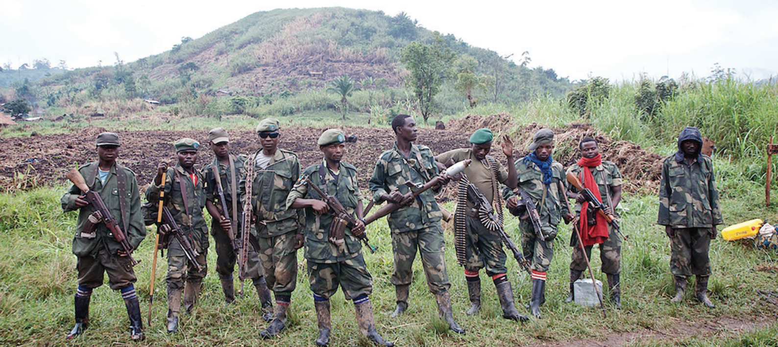
The People's Alliance for Free and Sovereign Congo (APCLS) is one of the many armed groups that bring together people who are unhappy about previous peace processes and who claim to defend the integrity of the national territory against all aggression from outside.

peacebuilding and statebuilding strategies. DDR programs are meant to reintegrate former combatants into civilian life by disarming and demobilizing them, and providing opportunities for income generation to reduce the chance they rearm and remobilize. The 2002 Global and Inclusive Agreement, the 2003 Dar El Salaam Accord, and the 2003 Sun City Agreement all laid the basis for comprehensive DDR programs. The 2003 Sun City Agreement fed the 2004 Commission Nationale de Désarmement, Démobilisation, et Réinsertion (CONADER) and Structure militaire d'intégration (SMI), both initiatives to organize the disarmament, identification and categorization of combatants who could either reintegrate into civilian life or integrate into the FARDC. In 2015 the Congolese government initiated its third major national DDR program called DDR III, in order to reintegrate Congolese ex-combatants into civilian life (Vogel & Musamba (2016). These programs have, until now, not merited significant positive results due to several challenges.