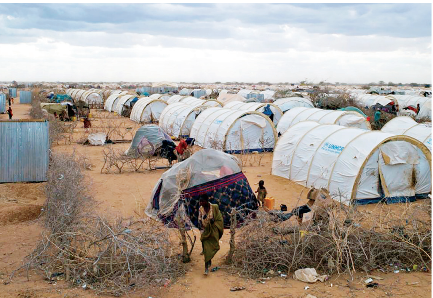
A general view of the tented settlement near the Ifo II refugee camp in Dadaab, near the Kenya-Somalia border.

Al Shabab exploits Kenya’s long-standing internal tensions, real or perceived marginalization, and use of state violence against Somalis and Muslims to expand and multiply violent attacks, as the government conveniently avoids these issues in its securitization responses.