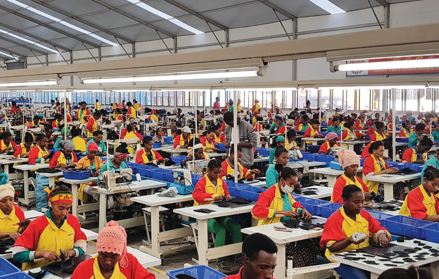
Ethiopian factory workers make shoes at the Ganzhou Huajian International Shoe City Company in Addis Ababa, Ethiopia on August 1, 2017

the international contingent to ensure safe passage of international vessels across the Gulf and the Somalia coast. Chinese peacekeepers are part of the United Nations Mission in South Sudan (UNMISS) troops. Given Chinese oil interests in South Sudan, the peace-keepers are welcome by the local authorities.