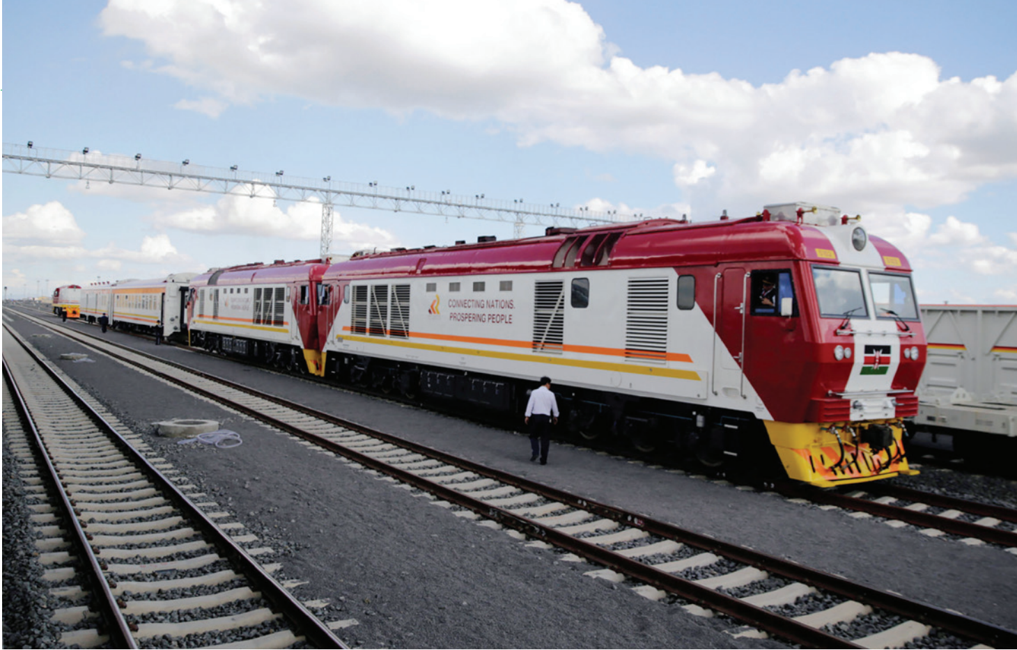
Kenya Standard Gauge Railway (SGR) line constructed by the China Road and Bridge Corporation (CRBC) and financed by the Chinese government

rival China than to assist African countries. Given the 'America first' mantra of current US leadership, chances of implementing a grand rival economic strategy are moot. What promises to be common is propaganda (cheap to execute) and influencing African mainstream media firms and opinion leaders as is already happening in Kenya and elsewhere in Africa.